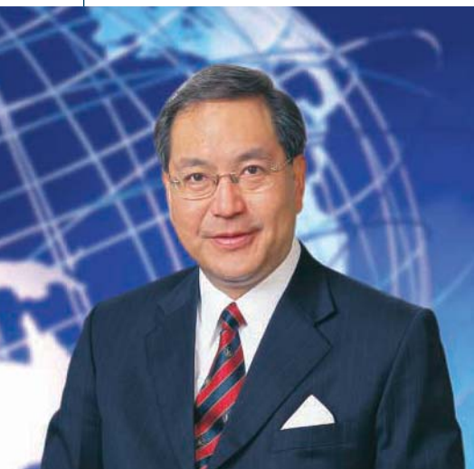
Professor Arthur Li Kwok Cheung